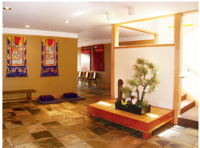
An Ikebana flower arrangement in the lobby of our Sacred Studies Hall.