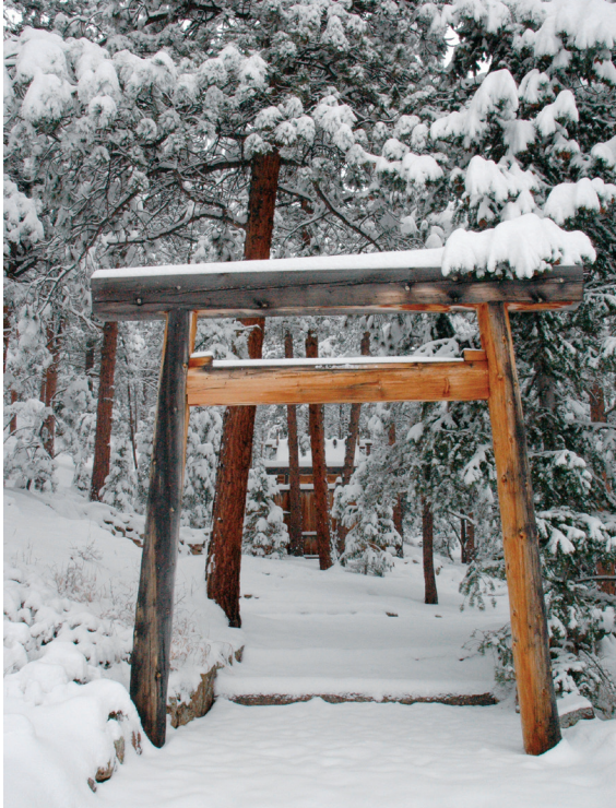
One of the Shinto-style gates leading to the Kami Shrine.