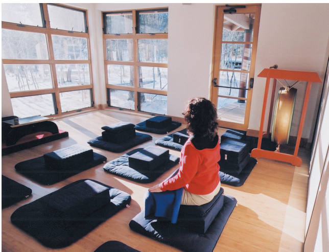
SMC has numerous shrine rooms which can accommodate meditation and yoga retreats, as well as conferences.