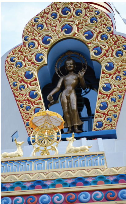
A standing Buddha in the structure's portal.