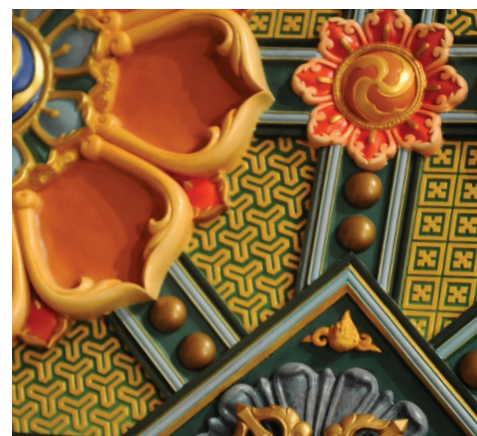
Much of the Stupa's ornamentation is hand-carved, including these indoor pillars.