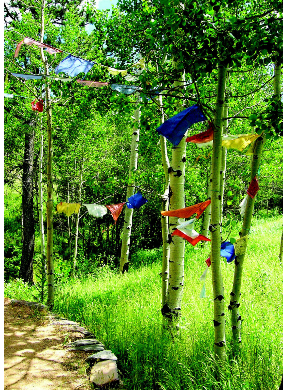
A spring view of the scenic trail leading to the Great Stupa