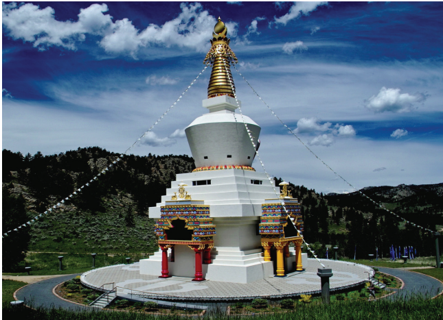
The Great Stupa of Dharmakaya stands 108 feet tall and crowns a meadow at the upper end of SMC's main valley.