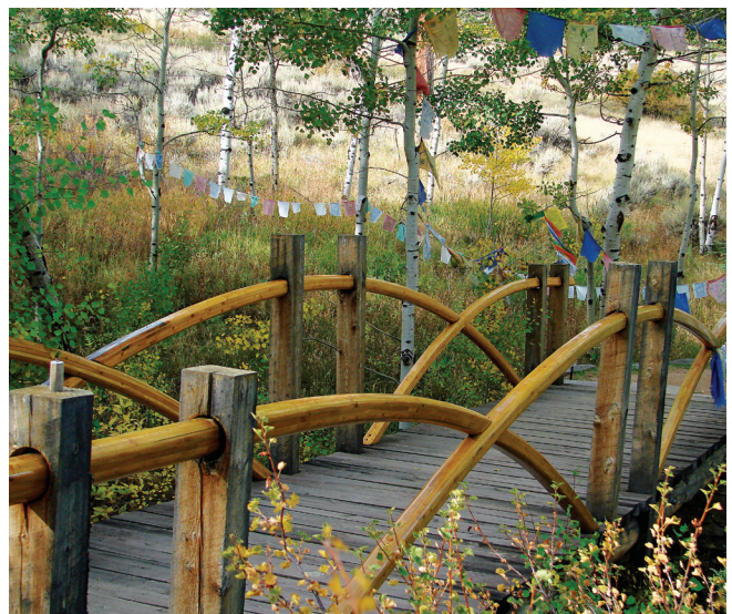
The Stupa trail in autumn, with Tibetan prayer flags strung from the aspen.