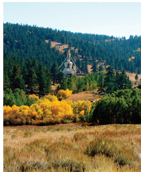
View of the Stupa in autumn.