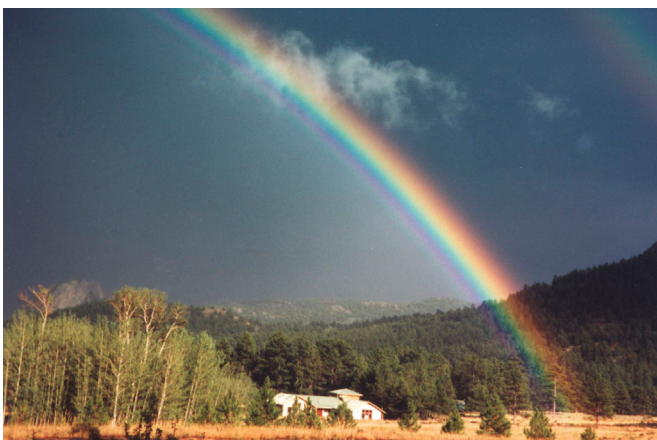
A rainbow glistens over the mountain meadows.