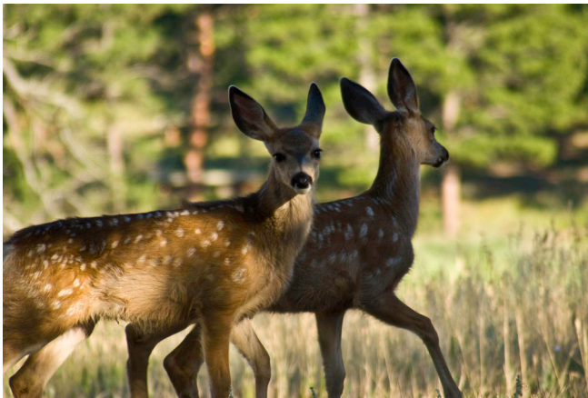
SMC is home to dozens of species of wildlife including mule deer.