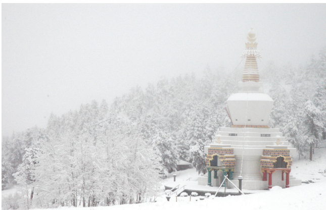
The Stupa after a winter snowfall.