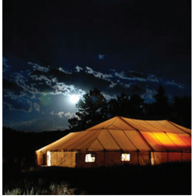
The summer shrine tent lit up at night.